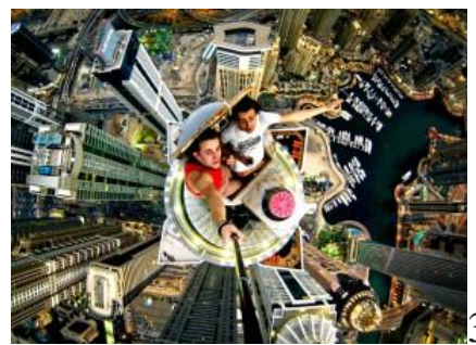
35 Reasons Why Dubai Should Be On Your