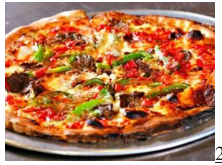
23 Pizzerias In New York That Will Make You